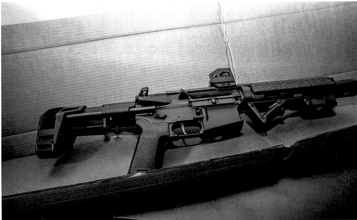
Fig. 3: The .300 caliber Franklin Armory FAI-15 .300 caliber semiautomatic firearm equipped with a binary trigger Gooden used in the shooting.

18. On February 18, 2024, Gooden used two AR-15-style semiautomatic firearms Defendant Dyrdaahl provided to Gooden—the firearm equipped with a binary trigger and loaded with .300 Blackout ammunition, and a Palmetto State Armory model PA-15 firearm—to ambush police officers and firefighter paramedics who were responding to a call for help in his home. The attack killed two police officers and a firefighter paramedic and injured a third police officer.