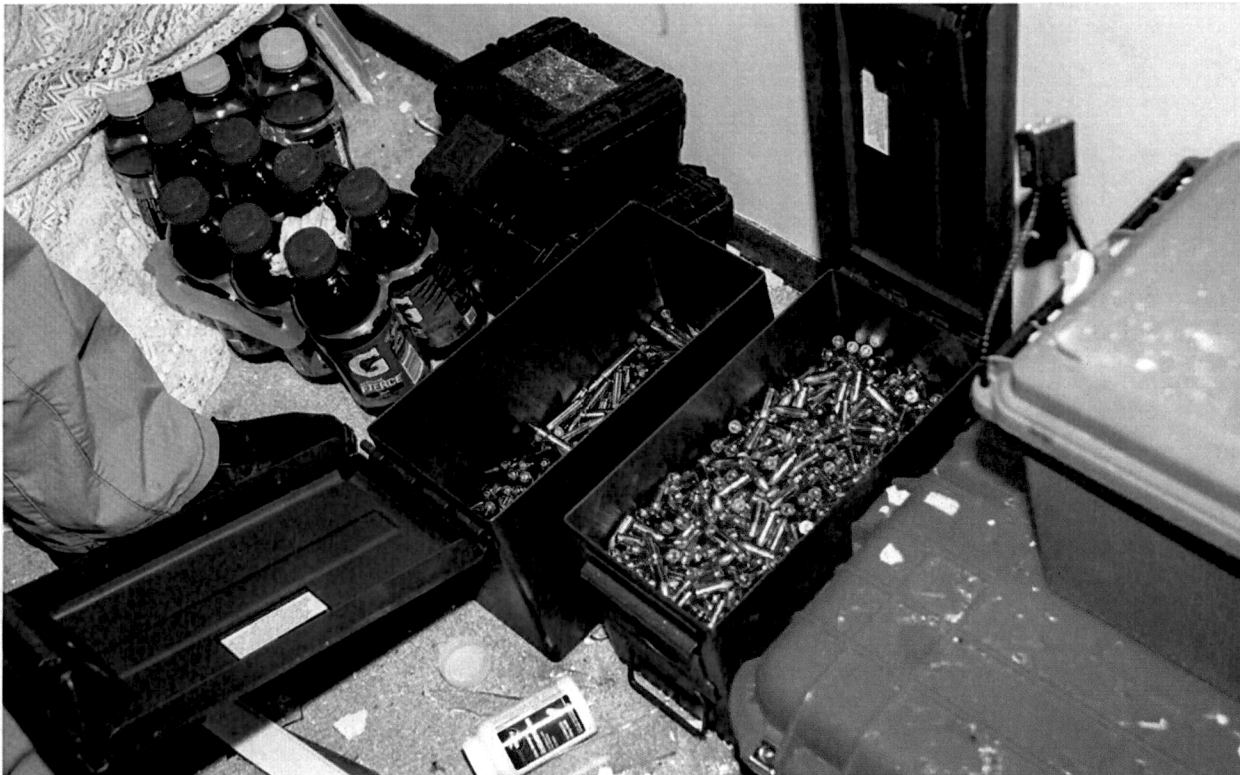
Fig. 5: Boxes of ammunition and loaded magazines found in the bedroom Dyrdaahl and Gooden shared.

20. In furtherance of the conspiracy, and to accomplish the objectives of the conspiracy, the following overt acts, among others, were committed in the State and District of Minnesota.