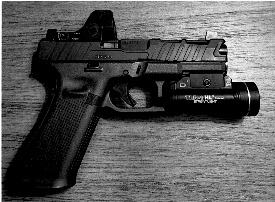
Fig. 1: The Glock 47 9mm semiautomatic pistol Dyr Dahl bought for Gooden.