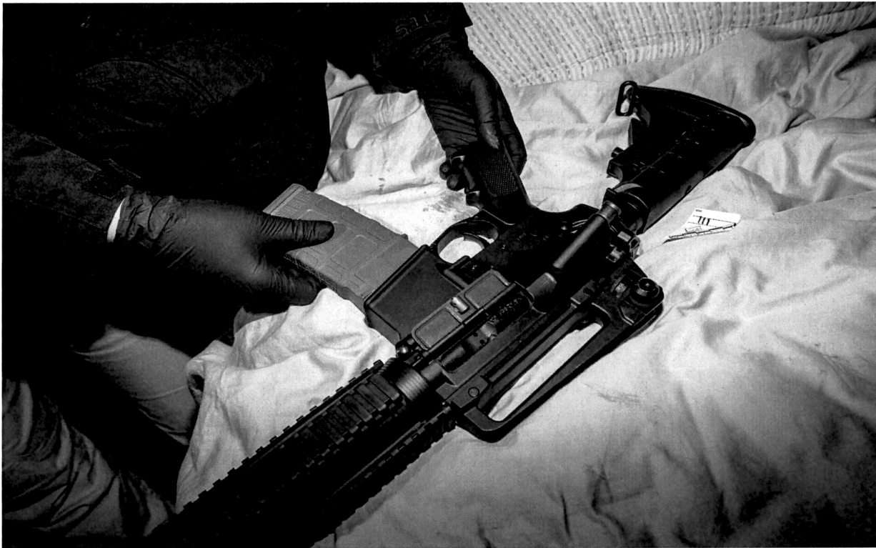
Fig. 4: A Palmetto State Armory PA-15 .223 caliber semiautomatic firearm Gooden used in the shooting.

19. Gooden fired more than 100 rounds at the first responders during the attack. After the attack, law enforcement officers found in the bedroom Defendant Dyrdaahl and Gooden shared a stockpile of fully loaded magazines as well as boxes with hundreds of additional rounds of ammunition and additional firearms.