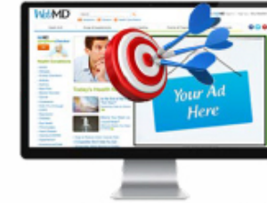
Outreach Display Targeting

The Retargeting campaign will show your ad to people who have left your website as they visit other websites on the web.