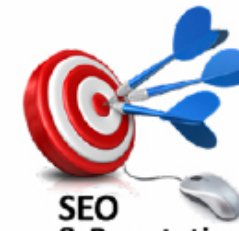
SEO & Reputation Management

An IP Targeting campaign will show your ad to the people on your list where we have matched their street address to their IP address.