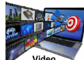
Video Pre-Roll Targeting

Let us develop a mobile version of your website